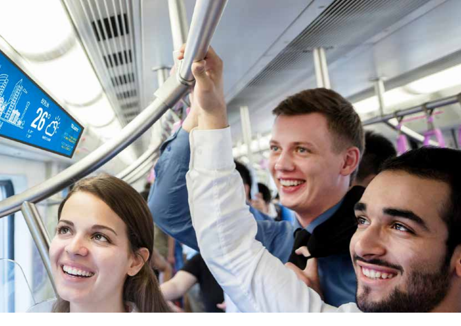
Teleste's ultrawide TFT LCD displays provide a new level of information and visuality for passengers during their journey.