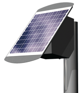
20W Solar Module

Hard-wiring into grid power or street lighting infrastructure