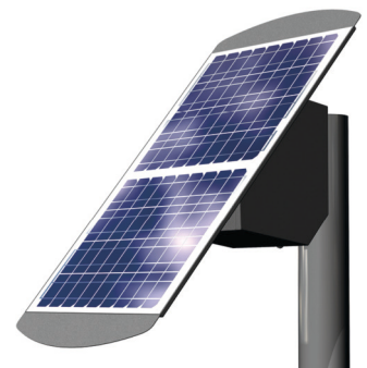
40W Solar Module